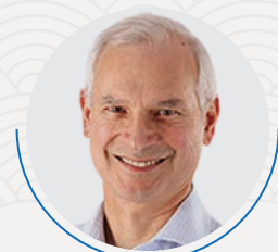
Jamshyd N Godrej

Past President, CII (1993-94) Chairman & Managing Director Godrej & Boyce Manufacturing Company Limited