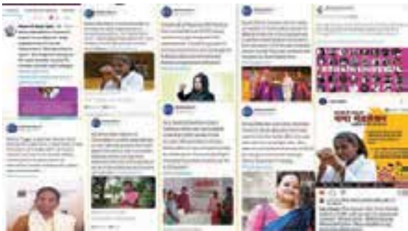
Official Twitter handles MyGovIndia - A Citizen engagement platform of Government of India and Mann Ki Baat - Hon'ble PM Narendra Modi's monthly programme featured stories of the exemplars on International Women's Day 2020