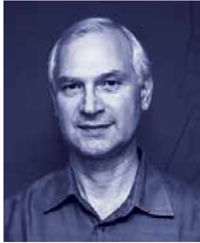
Jamshyd N Godrej

Chairperson, CII Foundation and Chairman & Managing Director Godrej & Boyce Manufacturing Company Limited