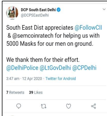
DCP South east Delhi appreciating receiving 5,000 masks for police personnel