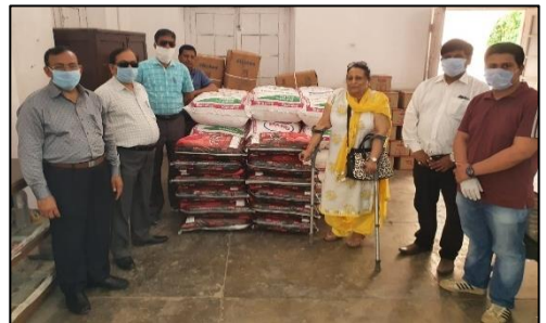
Medical equipment being handed over to the UP Govt. by CII in Lucknow