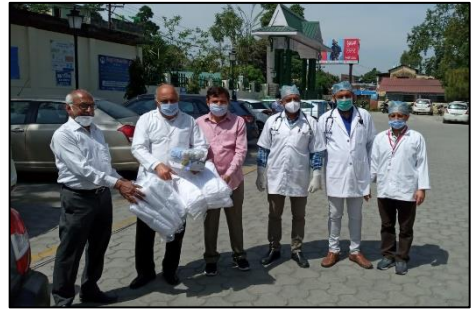
Gloves and masks distribution by CII members, Civil Hospital Paonta Sahib, Himachal Pradesh

CII Uttarakhand distributed 200 sanitizers for the protection of Corona warriors who are working tirelessly on the field.