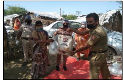
Distribution with SEEDS

In collaboration with Oxfam, cooked meals are being distributed among the migrant labourers in seven locations in Delhi. Till date, 29,435 meals have been distributed. 500 Kgs of ration was distributed among 85 labourers through NGO Serve Samaan, and 900 ration kits were distributed in East Delhi through the support of the NGO SEEDS.