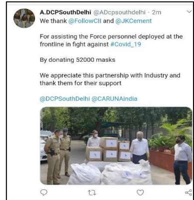
DCP South Delhi's tweet on receiving Masks

5,000 masks have been provided to Delhi Police personnel. 5,000 masks to Delhi Police with the help of CII Delhi State Office were also donated. In Dwarka, Delhi, 400 litres of sanitizers were provided to police personnel. IIT Delhi and CII collectively donated over 1,000 face shield masks to the Mohalla clinics in Delhi.