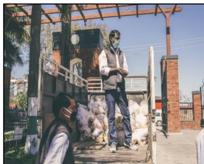
Distribution of Ration kits