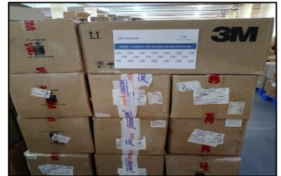
Hygiene Kits provided to Government of Haryana by CII with support from industry members