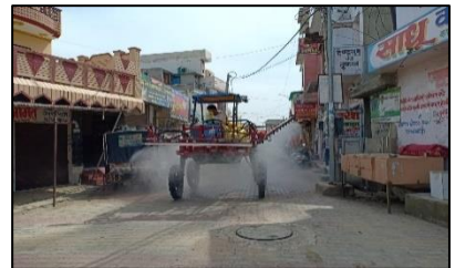
Sanitization Drive in Haryana