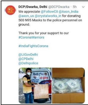
DCP Dwarka, appreciating CII's contribution