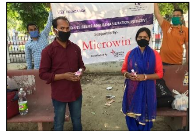
Sanitizer distribution in Patiala