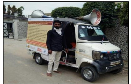
Awareness Van in Raikot, Ludhiana

(b) Provision of masks, gloves, sanitizers etc. to village frontline workers such as volunteers, Anganwadi workers, cooperative leaders, and village panchayat workers. 3,000 sanitizers have been distributed among disadvantaged farmers and village