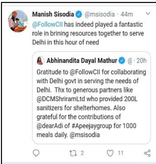
Manish Sisodia, Deputy Chief Minister of Delhi appreciating CII's efforts