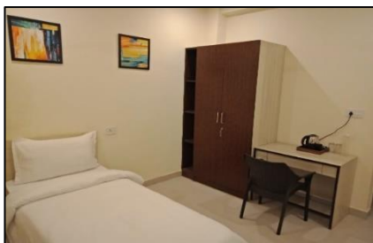
12 Room quarantine facility for COVID-19

In Rudrapur , 1,500 cooked meals have been distributed along with 50 ration kits. Century Textiles in Rudrapur has undertaken sanitization of the industrial areas and has provided employment to women by ordering masks.