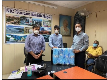
Handing over of masks to the NOIDA police and NOIDA DM