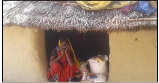
Beneficiary in Jaunpur, Uttar Pradesh

"I am a shopkeeper, but I lost my livelihood as the shop is now closed due to the lockdown. I have two kids at home. During the lockdown, we used up all our savings and desperately needed help. I am very thankful to Rama didi who helped us in such a situation and provided us with ration of 2 months."