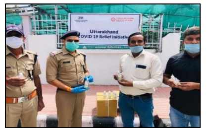
CII, PRSI distribution of sanitizers in Dehradun