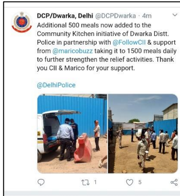
DCP Dwarka, appreciating contribution in form of cooked meals by CII

In Delhi , 5,000 sanitizers have been distributed in various parts of Delhi by the CII Delhi State Office, and in association with the Delhi Police, 5,000 masks have been distributed.