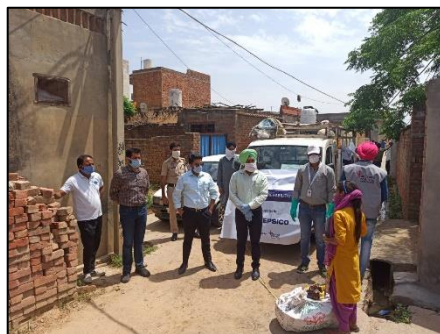
Ration kits distribution by CIIF in Nabha, in presence of SDM Nabha and officials of Coop and Agri Department

(c) Provision of Ration kits for 8,000 needy families in the villages , including migrant farm labourers, BPL households and small farmers. In Haryana, 3,250 ration kits and 1,000 health and hygiene kits have been distributed in 44 villages in Sirsa, Fatehabad and Rohtak. Relief has been provided to 600 families in Jhajjar (600 ration kits and 6,000 soaps). In 100 villages in Ludhiana and Patiala in Punjab, 3,000 ration kits have been distributed. Ration kits have been distributed to 255 families including, BPL households and farm labourers in nine villages of Nabha block of Patiala.