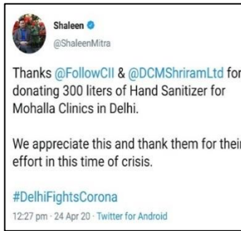
Shaleen Mitra's tweet appreciating efforts of CII for donation of 300 L Sanitizer