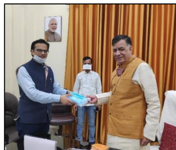
Handing over of Masks to the Industry Minister of UP

Lucknow: CII in collaboration with various member organizations, distributed 420 ration kits, 1,600 cooked meals, and 400 masks in the urban slums of Lucknow . For the Lucknow