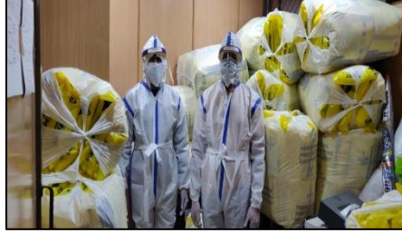
CII Delhi State Office delivered 500 PPE kits for Health workers in Mohalla Clinics in Delhi