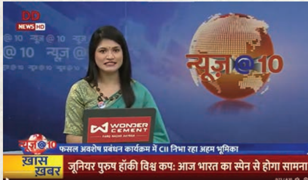
A 4.30 second program on crop residue management initiative led by CII Foundation

To amplify the message of zero-stubble burning through media, media familiarisation trips were organized in 2023. Teams from Doordarshan News (Hindi), Mint and Financial Express were taken to the field to see first-hand the project interventions and speak to farmers and other on-ground stakeholders. Several other news outlets covered our efforts and impact throughout the year.