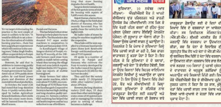
एफसी बैंक, सीआईआई ने पंजाब में क्रॉप