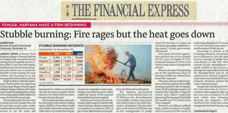
Curbing stubble burning