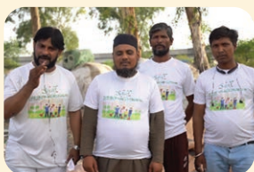
Member Safai Abhiyan and Aid Foundation (SAAF)