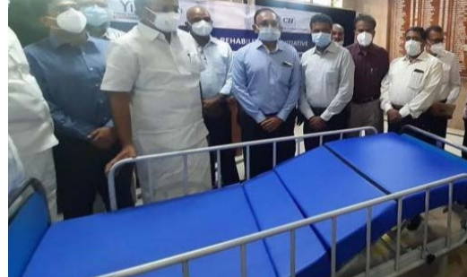
Yi and CII Thoothukudi donation of Fowler Beds in Tirunelveli