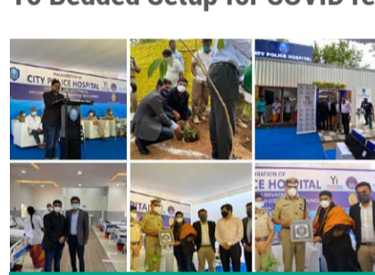
Yi Hyderabad - Bed Setup for Covid Relief