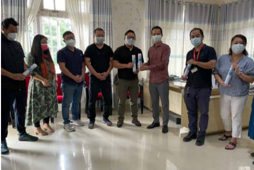
Yi Mizoram - Donation of Oxygen Concentrators