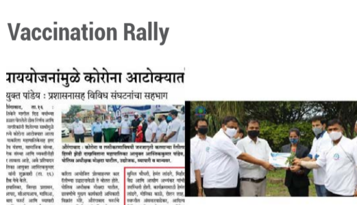
Yi Aurangabad - Vaccination Rally