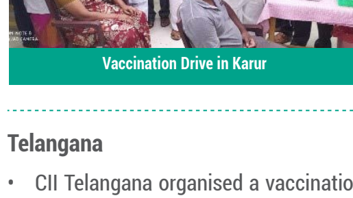
Vaccination Drive in Karur