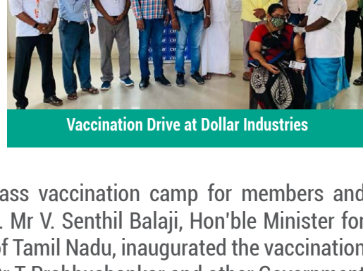
Vaccination Drive at Dollar Industries