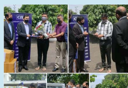
Donation of Oxygen Concentrators in Aurangabad