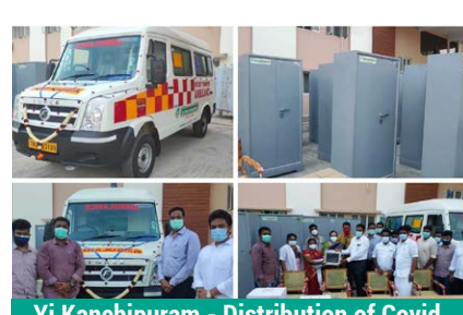
Yi Kanchipuram - Distribution of Covid Relief Material