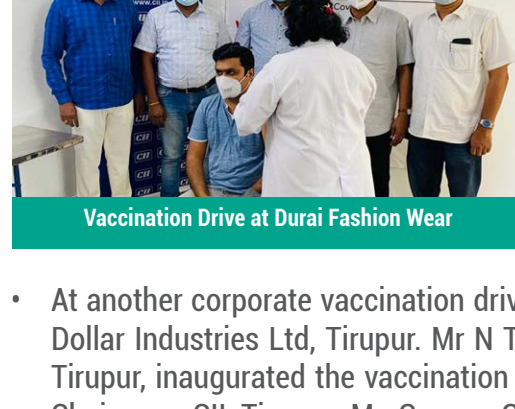
Vaccination Drive at Durai Fashion Wear