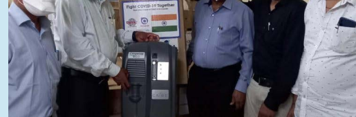
Oxygen Concentrators Donated in Ambajogai