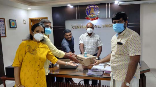
Yi Trichy - Distribution of Covid Relief Material