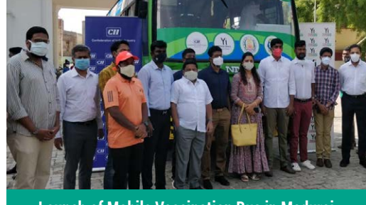
Launch of Mobile Vaccination Bus in Madurai