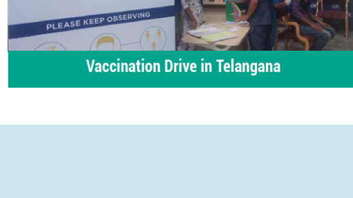
Vaccination Drive in Telangana