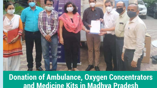
Donation of Ambulance, Oxygen Concentrators and Medicine Kits in Madhya Pradesh