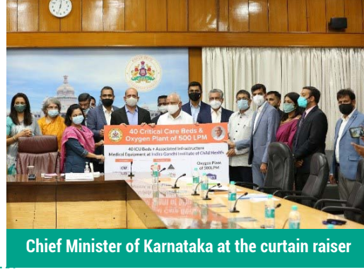
Chief Minister of Karnataka at the curtain raiser