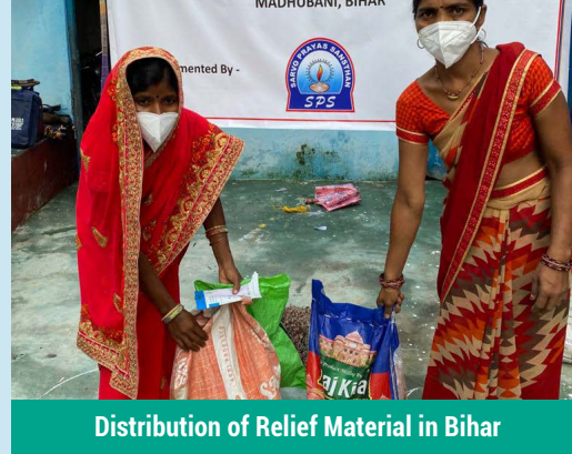
Distribution of Relief Material in Bihar