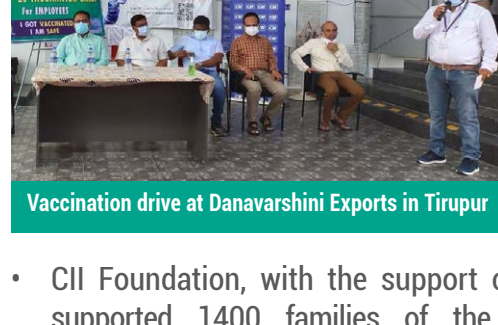
Vaccination drive at Danavarshini Exports in Tirupur