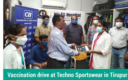
Vaccination drive at Techno Sportswear in Tirupur