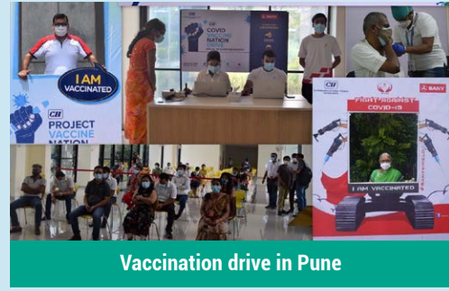
Vaccination drive in Pune