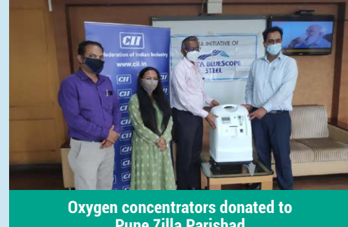
Oxygen concentrators donated to Pune Zilla Parishad