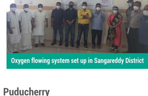
Oxygen flowing system set up in Sangareddy District