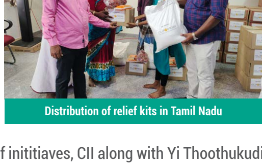
Distribution of relief kits in Tamil Nadu