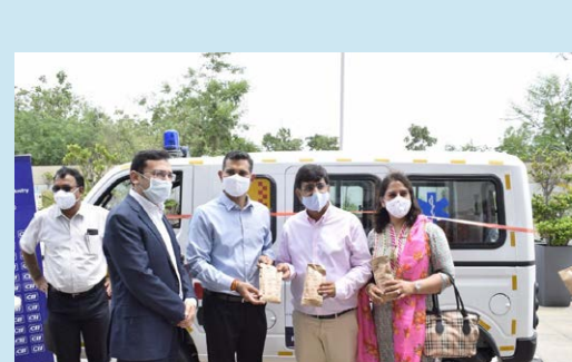
Ambulance and home isolation kits handed over in Madhya Pradesh