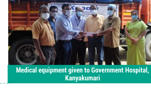
Medical equipment given to Government Hospital, Kanyakumari