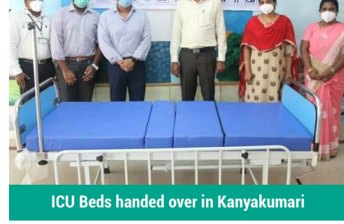
ICU Beds handed over in Kanyakumari