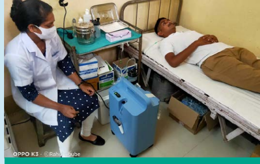
Oxygen concentrators donated in Pune