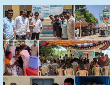
Yi Kanchipuram Vaccination Drive