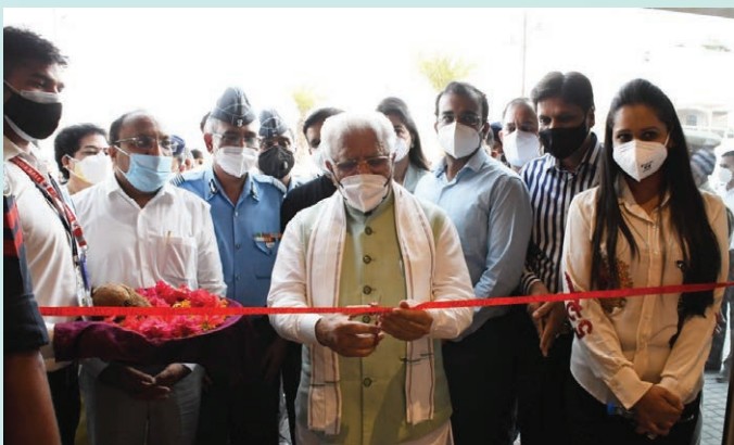
Haryana Chief Minister Inaugurating Gurugram Covid-care Centre