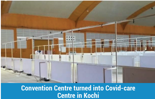
Convention Centre turned into Covid-care Centre in Kochi